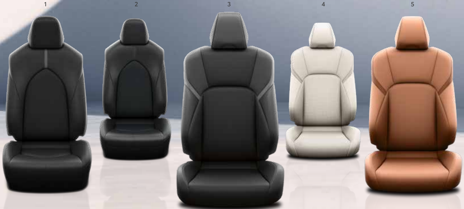
1. Black fabric Standard on Luxury 2. Black synthetic leather Standard on Luxury Business