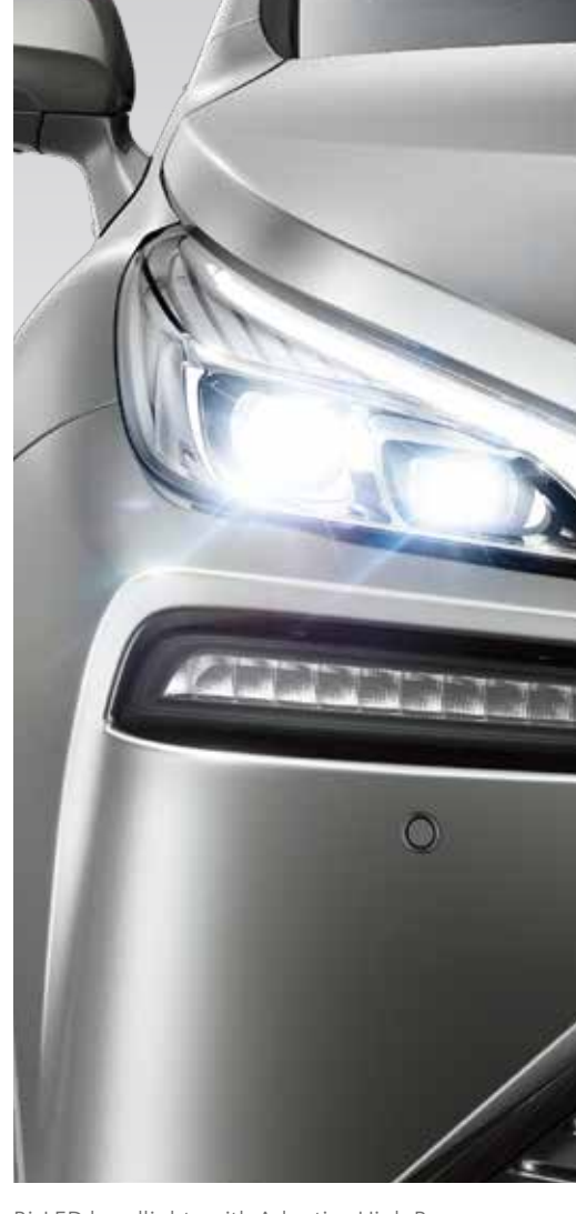
Bi-LED headlights with Adaptive High Beam System enable and disable individual LEDs within each headlamp for precision control.