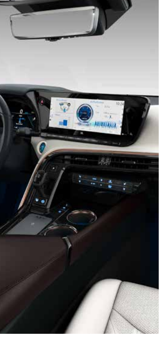
Mirai Ambassador grade is available with a choice of black leather with silver details or white leather with copper details.