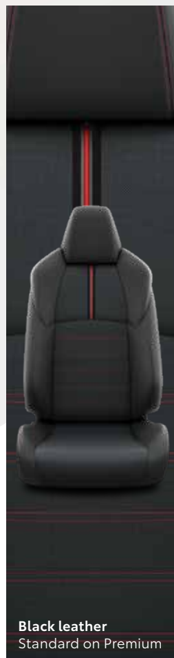
Black leather Standard on Premium