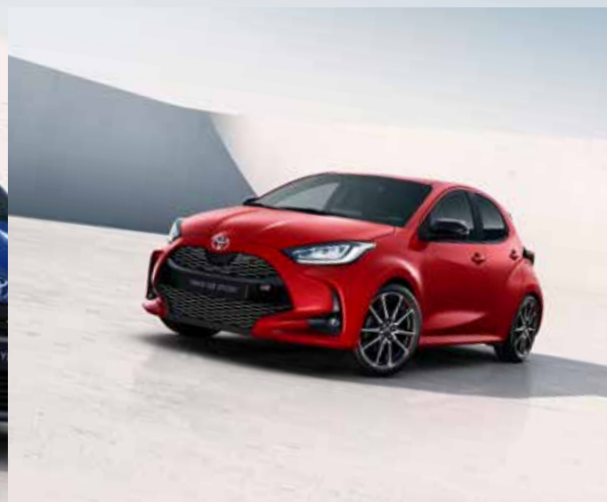
Yaris monotone colour choices