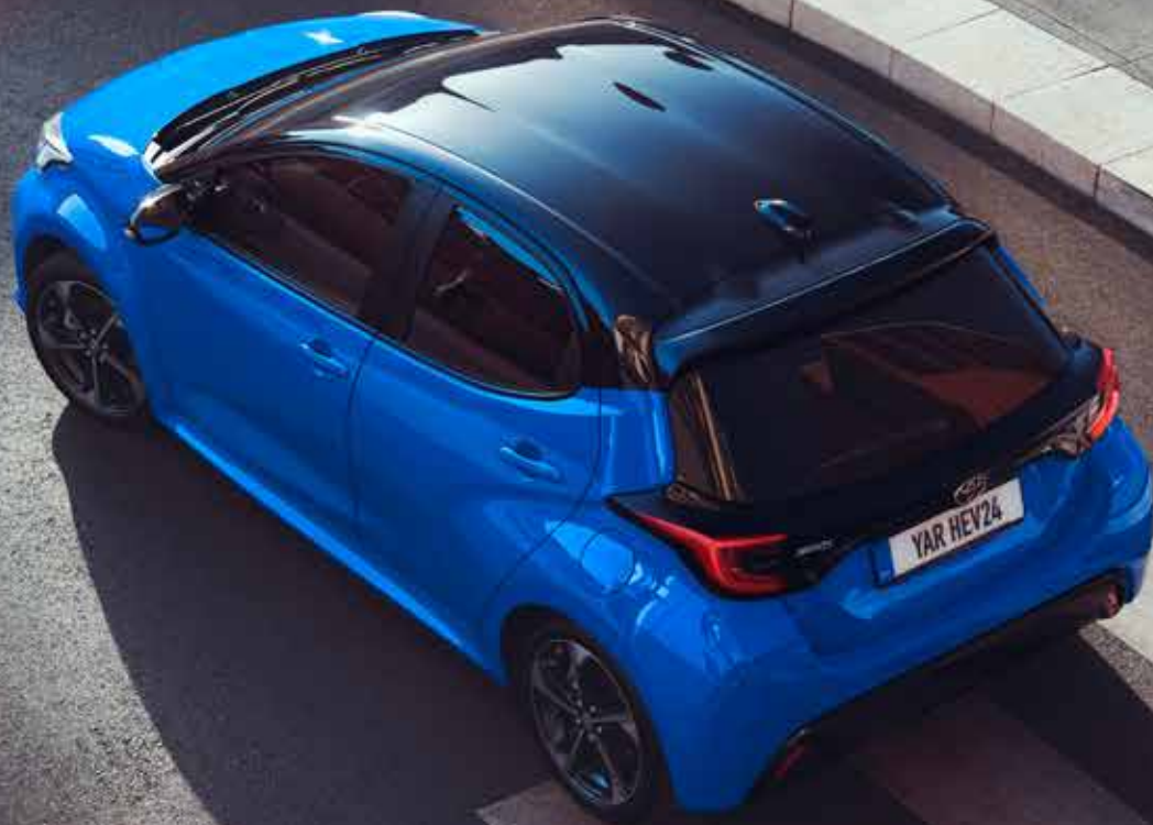
Yaris bi-tone colour choices

Choose from a stunning palette of eye-catching colours, including bold primaries and shimmering metallics. And with two all-new colours, Juniper Blue and bi-tone Neptune Blue, your Yaris will be sure to stand out.